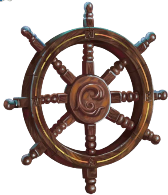
Handout #1: Captain Renlock's Wheel

TO FIND YOUR WAY, YOU MUST BE ABLE TO NAVIGATE BY THE SUN, THE MOON, AND THE STARS, PRAYING UPON A LUCKY COMET TO FIND YOUR WAY HOME.